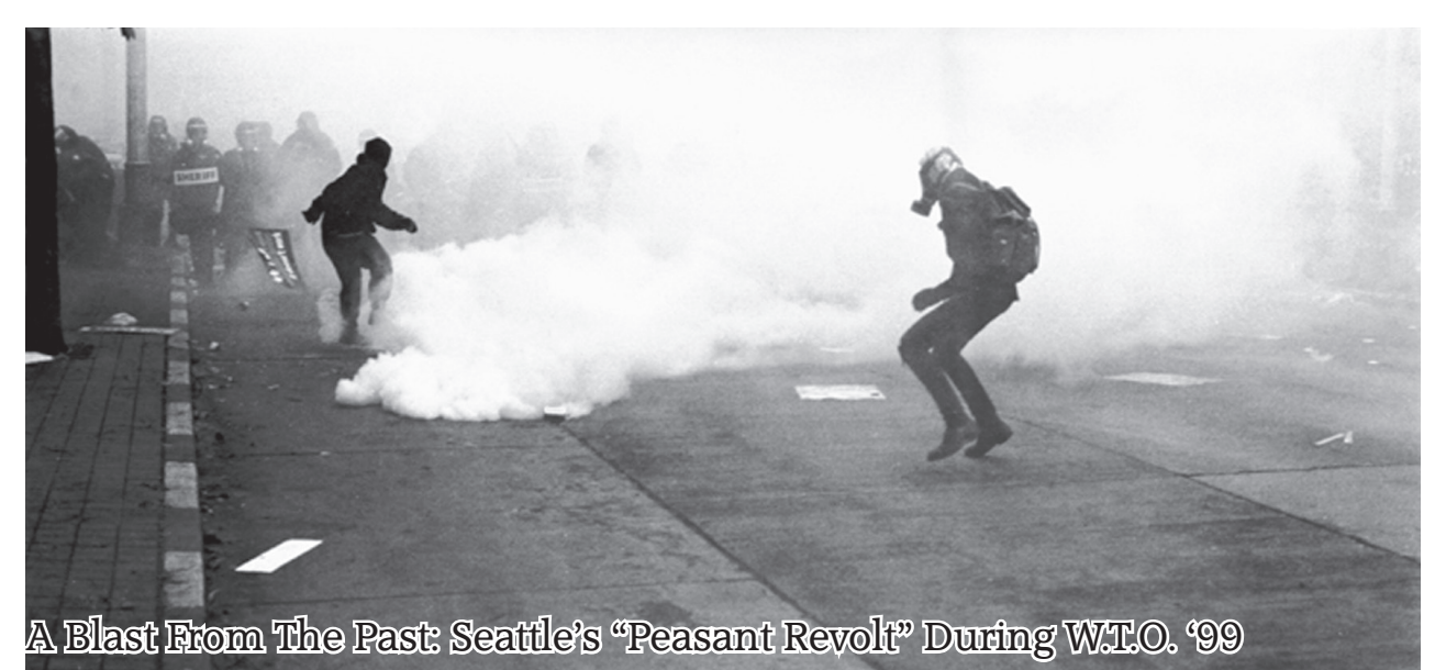
This text was respectfully gleaned from the online blog angry-hippo.tumblr.com.

And now the police, the politicians and the clergymen wish to murder the memory of Travyon Martin by pleading for everyone to "remain calm" or to "raise your voice, not your hand" in hopes of maintaining "peace and order", which depends on a systemic violence directed towards the downtrodden and exploited. It is becoming increasingly clear that we must think for ourselves and act accordingly. Would Travyon's memory truly be respected and honored if people expressed their discontent by merely shuffling around the sidewalk under the hate-filled gaze of the police?